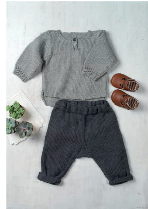
Pop & Treacle