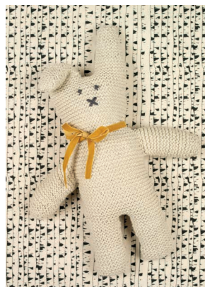
Cottontail Rabbit FREE