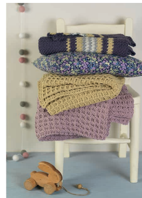
Rhubarb & Waffle

free patterns available from www.erikaknight.co.uk