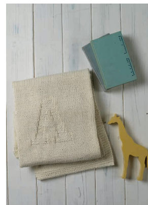
A to Zzz Blanky FREE