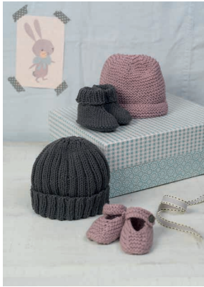
Bubble & Squeak