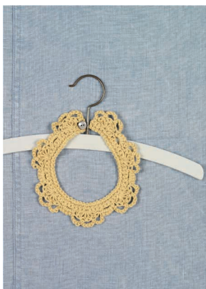
Curly Wurlly FREE

free patterns available from www.erikaknight.co.uk